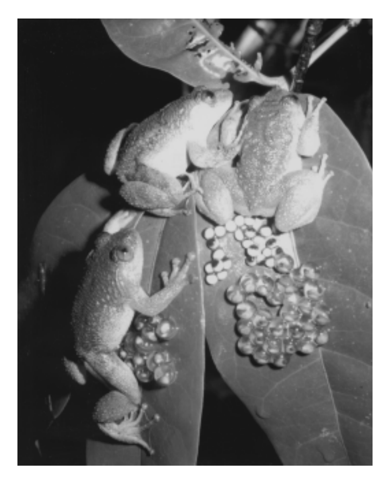
FIG. 1. This figure shows oviposition behavior and lack of amplexus in Nyctibatrachus cf. humayuni . The female to the right was laying eggs without the male being in amplexus while another gravid female waited beside it (note the bulging abdomen). The male on the lower part of the leaf was waiting for the female to finish oviposition, it fertilized the eggs after the female left. Note the old clutch at an advanced stage of development beside the male. Egg-clutches fertilized by a male are often clumped. Also note much larger toe-discs and thicker digits of male as compared to the females.

Egg-laying .—I observed seven complete egg-laying sequences. The following was a standard egg-laying process. Males vocalized usually from leaves ca. 10-100 cm above flowing water 2-30 cm deep. Observations on marked females revealed that females foraged in the territories of several males, which probably provided them time and opportunity to rank males and their territories. When a female was ready to lay a clutch of eggs she climbed to the spot from where a chosen male had been vocalizing. The male vocalized with slightly higher frequency of calling when the female approached. The male moved a few centimeters away from its calling post when the female approached but continued vocalizing. The female reached the exact original calling post and deposited eggs. If the female laid part of her clutch in another spot, it was always the second spot to which the calling male had shifted upon the female's arrival. Thus, the male, rather than the female, determined oviposition sites, with the female laying eggs exactly at the spot from where the male had been calling. There was no amplexus or any physical contact between the sexes (however, in another egg-laying sequence I observed 'pseudo-amplexus.' This preceded oviposition by 5 min and therefore did not serve the pur-