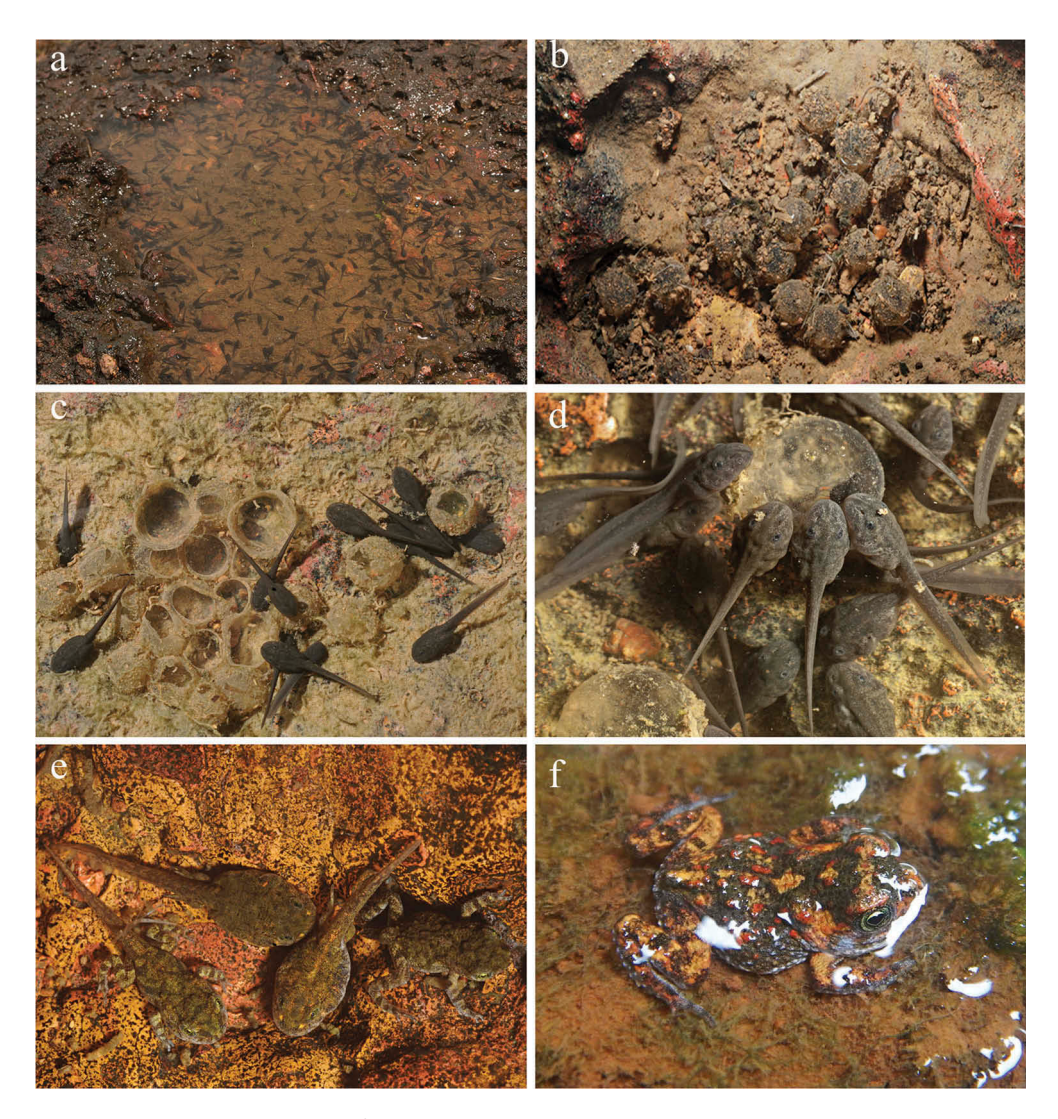
Figure 4. Larval development of Xanthophryne tigerina . (a) A shallow pool in a depression on a boulder serves as the larval habitat; (b) eggs laid in a pool on a lateritic boulder; (c) hatchlings; (d) growing tadpoles scraping on the surface of an egg laid during the second breeding bout; (e) tadpoles at different developmental stages; (f) a metamorphosed toadlet.

The shallow pools where the tadpoles developed measured 6.83 \pm 0.48 mm in depth and were 60–180 mm wide (n = 11, Figure 4(a)). The average temperature during the entire larval development was 25.7°C (min 23.9°C and max 27.2°C) with average relative humidity at 90% \pm 5%. The tadpoles were exotrophic and fed on algae growing in and around the small pools. They lived in high densities with as many as 100–120 tadpoles in a pool measuring 150 mm wide and 6.7 mm deep (Figure 4(a)). They ventured out of the water and fed on the algae growing on the moist rock when they ran out of food within the pool. Mosquito larvae and