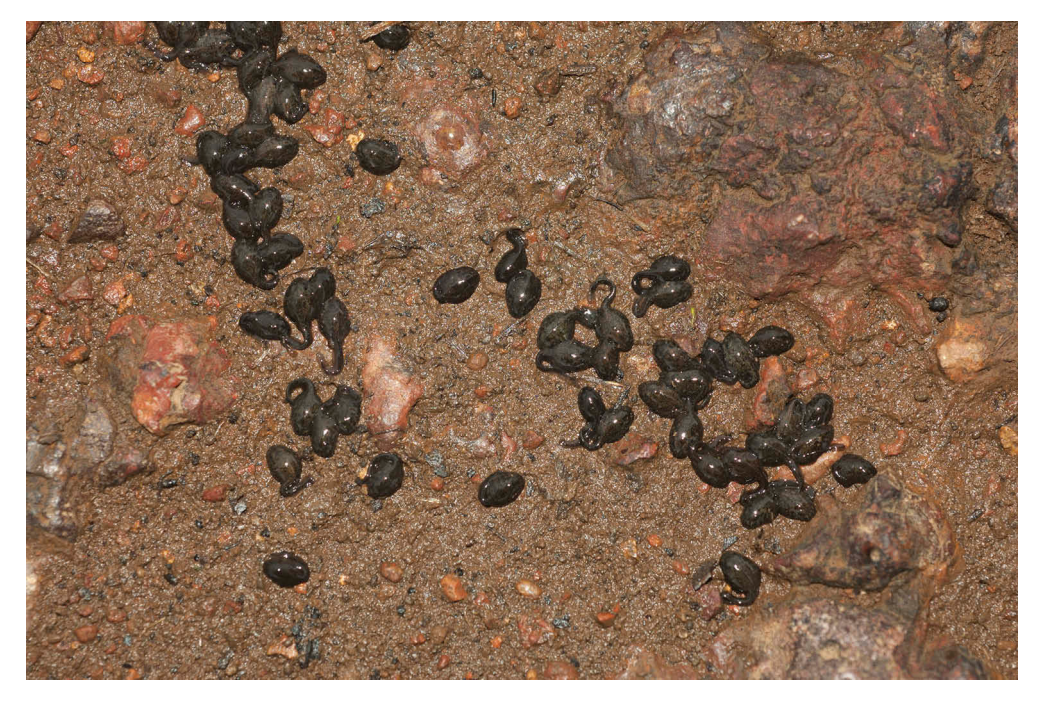
Figure 5. Desiccated pool and stranded tadpoles of Xanthophryne tigerina.

occasionally aquatic beetles inhabited these pools but no other anuran larvae or other organisms were observed. Tadpoles metamorphosed in 39 days from three pools we monitored in the wild (n = 17). No predators were observed feeding on X. tigerina eggs or tadpoles but we observed a terrestrial crab and a water scorpion ( Ranatra sp.) feeding on the freshly hatched immobile tadpoles of X. koynayensis from a pool at the edge of the rocky outcrop. During the break in the rainfall in 2014 and 2015 we observed stranded tadpoles in desiccated pools. Xanthophryne tadpoles were found to be surprisingly tolerant to desiccation as they were alive 5 hours after the pool had completely dried (Figure 5).