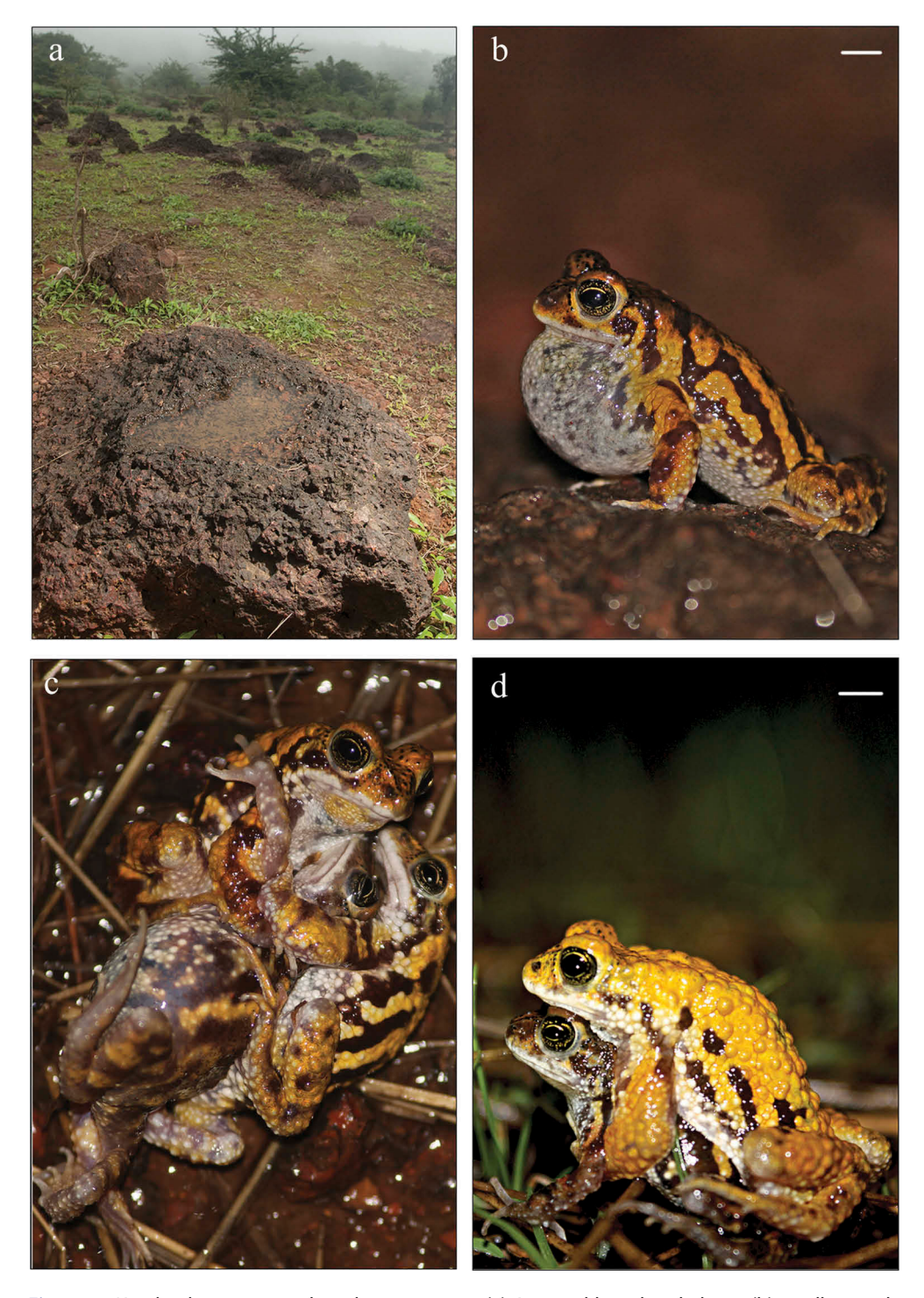
Figure 2. Xanthophryne tigerina breeding sequence. (a) A typical breeding habitat; (b) a calling male perched on a boulder; (c) a mating ball; (d) a pair in amplexus. Size bar = 5 mm.