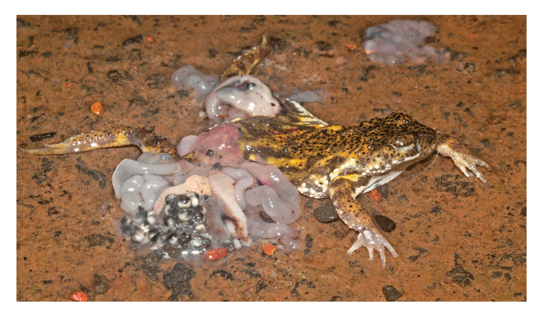
Figure 6. Road kill of a gravid Xanthophryne tigerina female.

Both Xanthophryne species are locally abundant but have extremely restricted distributions and are endangered (Biju et al. 2004; IUCN SSC Amphibian Specialist Group 2013). The breeding sites of X. koynayensis are legally protected as they fall under the Sahyadri Tiger Reserve and are relatively undisturbed. However, rocky outcrops at Amboli where X. tigerina occurs are subjected to severe pressure due to infrastructure development projects, tourism and changes in land use (Watve 2013). One of the threats that these toads face is depletion of loose rock due to its local use as construction material (VG and NG personal observations). During the day these toads take refuge