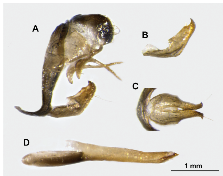
Figure 2. Male genitalia of Hypolycaena narada sp. nov. (paratype, NCBS-PY983). A: lateral view, with the aedeagus removed. B: right valva, lateral view from outside. C: ventral view of the fused valvae. D: aedeagus, lateral view. All separated parts of the male genitalia (B-D) are proportional to A. The scale bar is approximate.